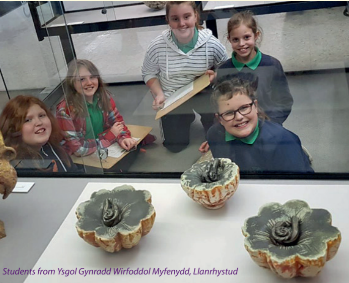
Students from Ysgol Gynradd Wirfoddol Myfenydd, Llanrhystud