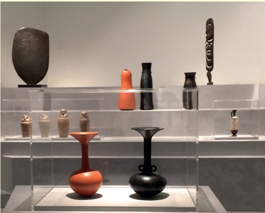
Tall Burnished Bottle by Magdalene Odundo (front left) on display at the Hepworth Gallery

Ceramics by Ladi Kwali, Shoji Hamada, Michael Cardew, Norah Braden, Katharine Pleydell Bouverie and Magdalene Odundo went to America to the Yale Centre for British Art exhibition Things of Beauty Growing: British Studio Pottery .